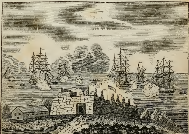
BOMBARDMENT OF FORT M'HENRY.....MAJOR ARMISTEAD. See Page 271.